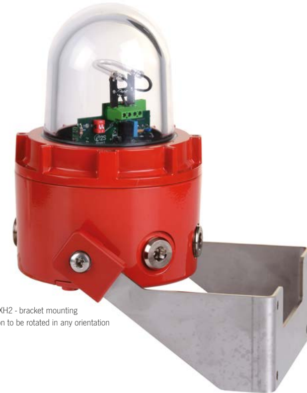
D1xB2XH1/XH2 - bracket mounting allows beacon to be rotated in any orientation