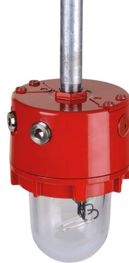
D1xB2XH1/XH2 - pendant mounting