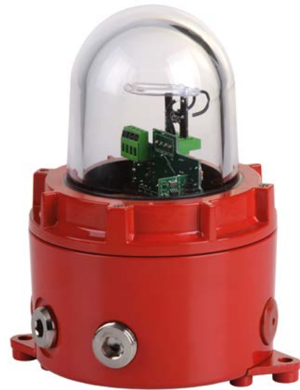
D1xB2XH1/XH2 - surface mounting