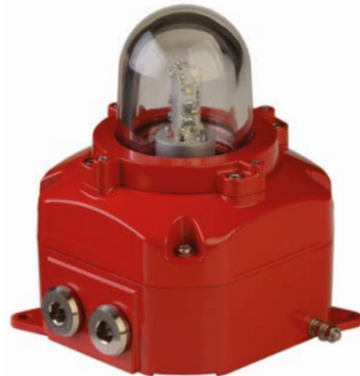
D2xB1XH1 / D2xB1XH2