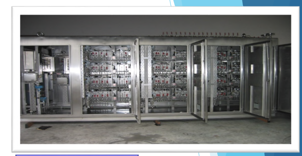
WHCP Rear View