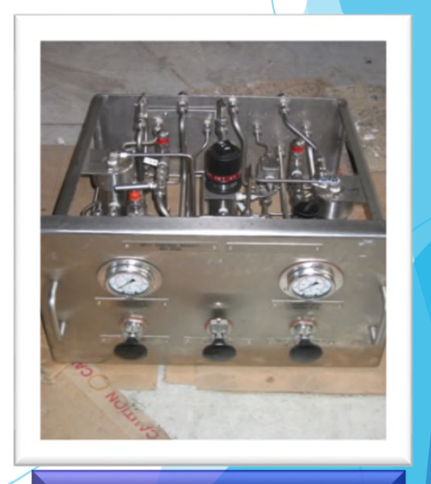
Well Control Module

14 oil wells, 6 water injection wells & 4 gas wells modules retractable type wellhead control c/w hydraulic accumulators