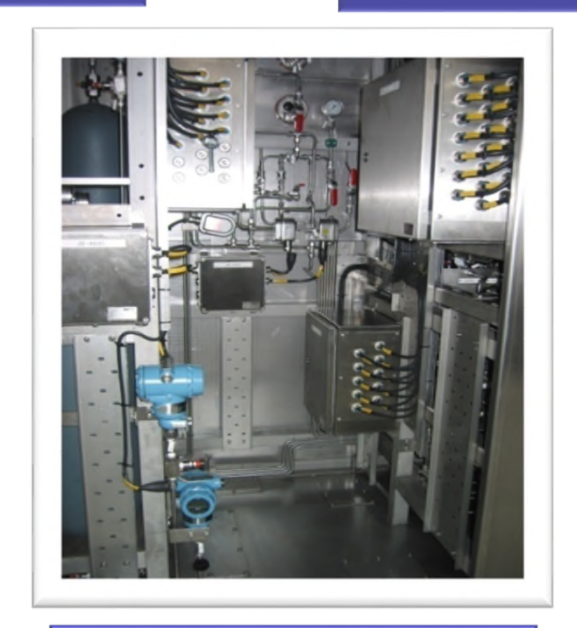
Junction Boxes in Common Section