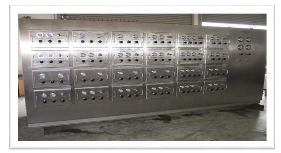
WHCP Front View (14 Oil Wells, 6 Water Injection Wells and 4 Gas Wells)